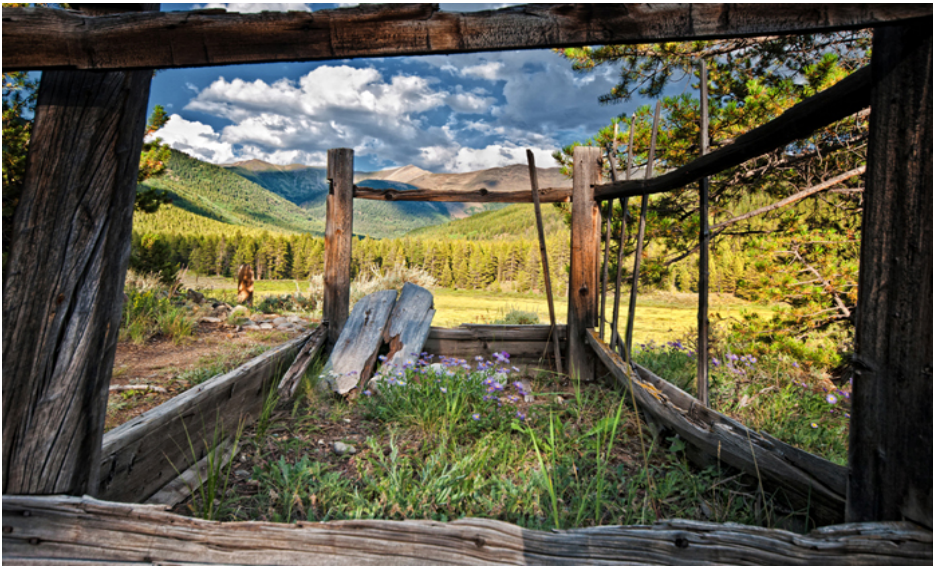
"The Final View" by Debi Boucher