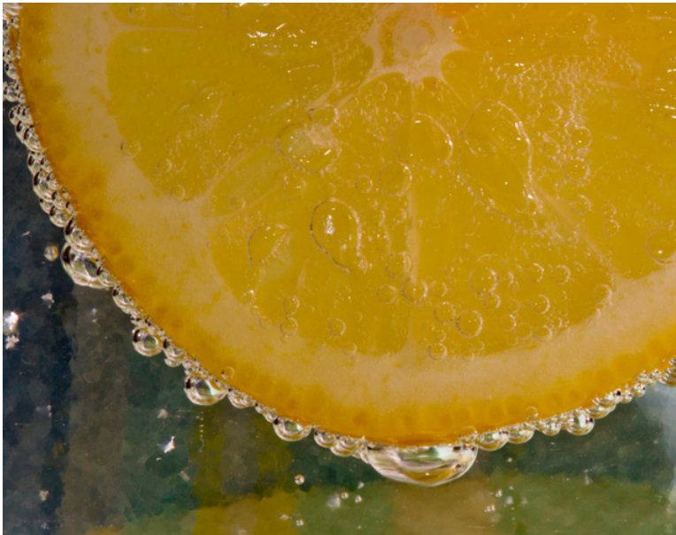
“Bubbly Lemon” by Galen Short